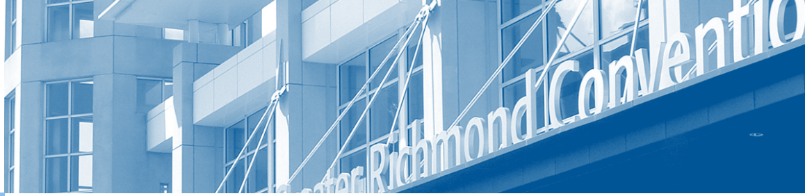
Lower Right Cover Photo Courtesy of VDOT